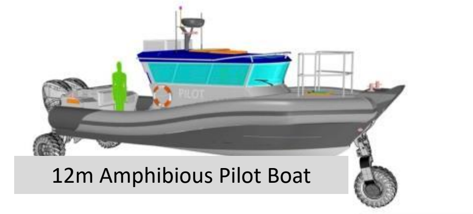
12m Amphibious Pilot Boat