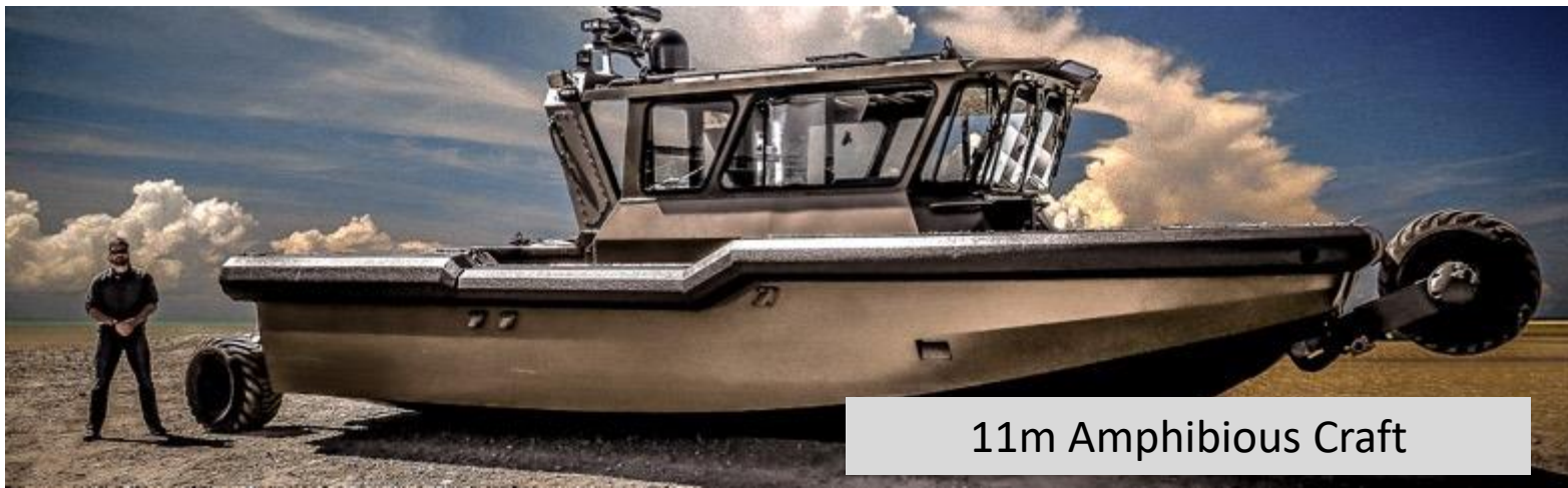
11m Amphibious Craft