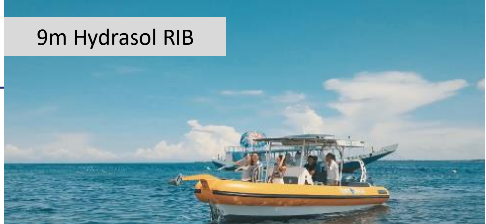
9m Hydrasol RIB